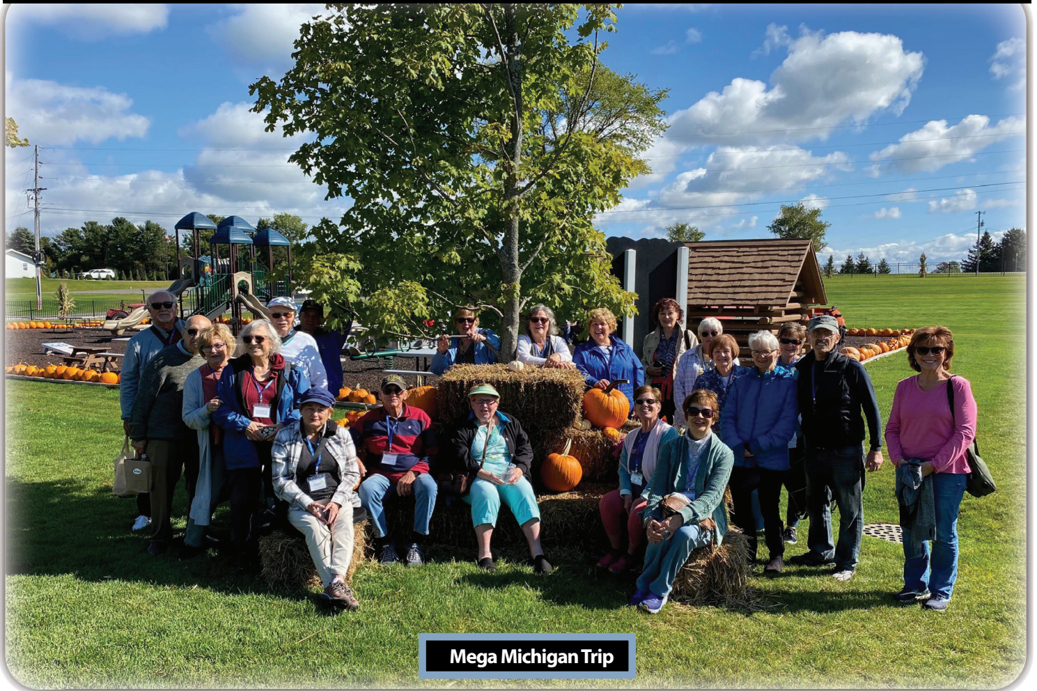
Mega Michigan Trip

Registration for our 22 passenger bus trips starts on Dec 4/5, along with two early charter bus trips that are scheduled for 2024. Sign up for all other 2024 trips begins on January 18 at the Trip Promotion Meeting.