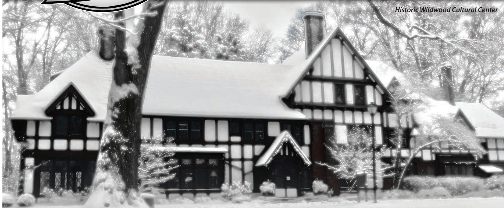
Historic Wildwood Cultural Center

Community Newsletter for the Residents of Mentor