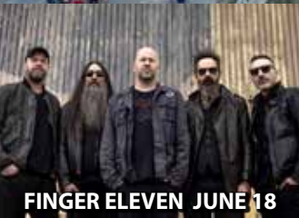
FINGER ELEVEN JUNE 18