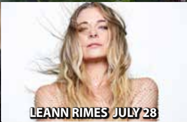
LEANN RIMES JULY 28